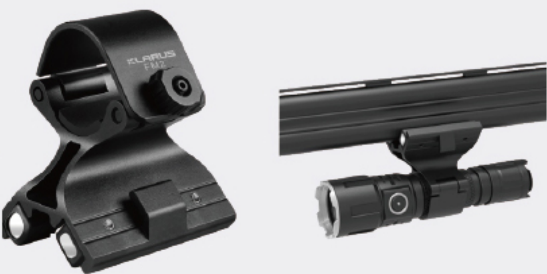
Magnetic Light Clamp FM2