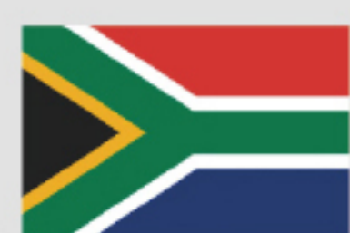
South African Navy Ordering Model: XT11