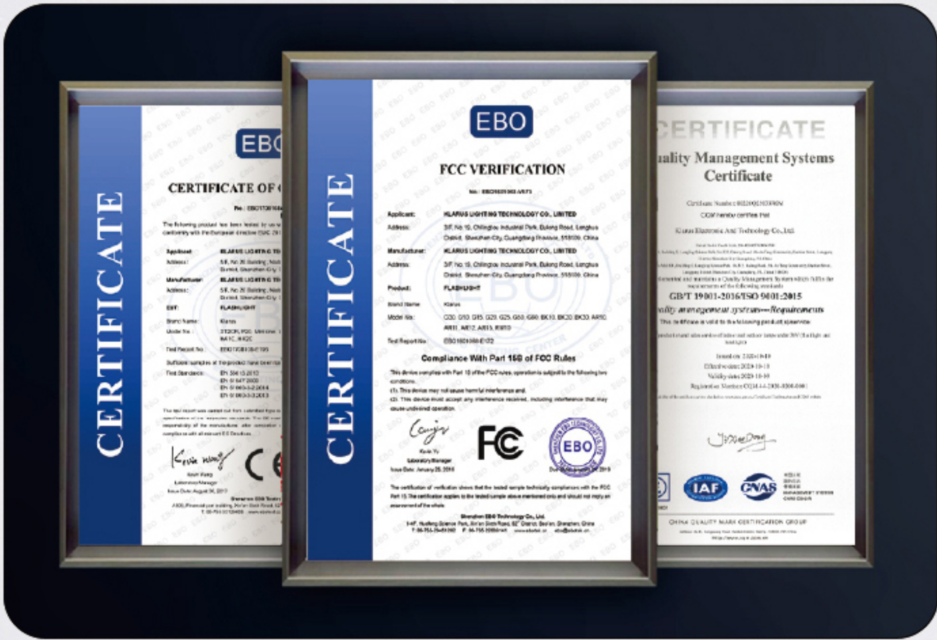
Various Authoritative Certifications