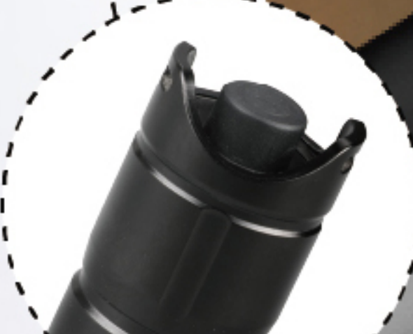
The 1st generation 2011

Main Switch: Classic tail switch design, super responsive to clicks