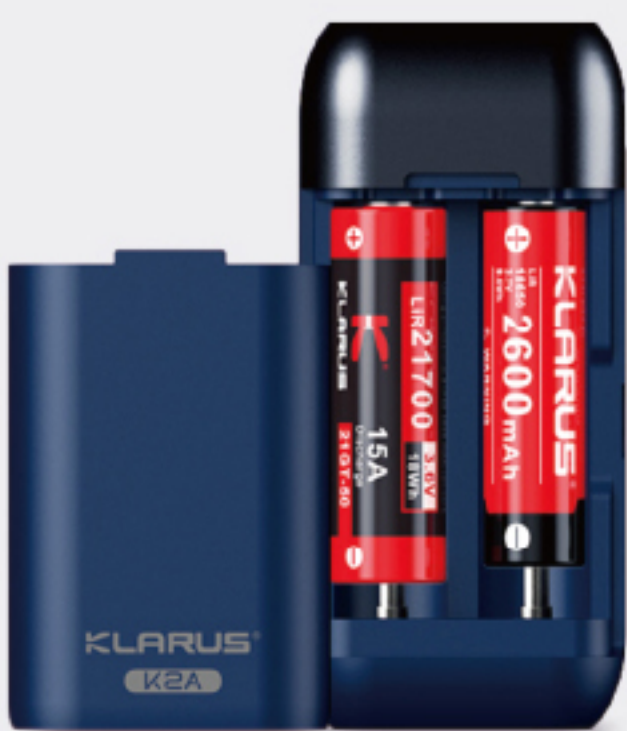
Battery Charger K2A