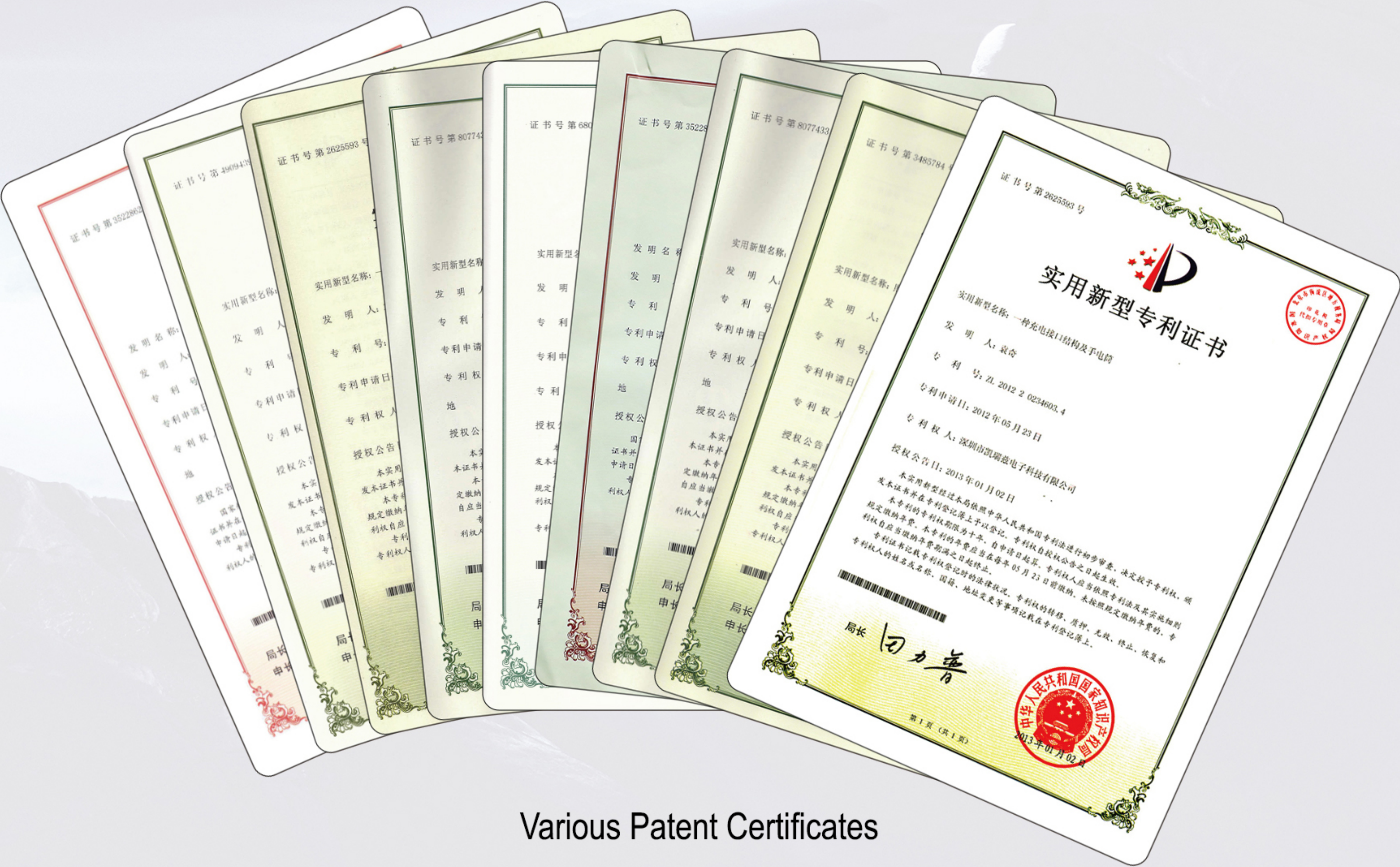
Various Patent Certificates