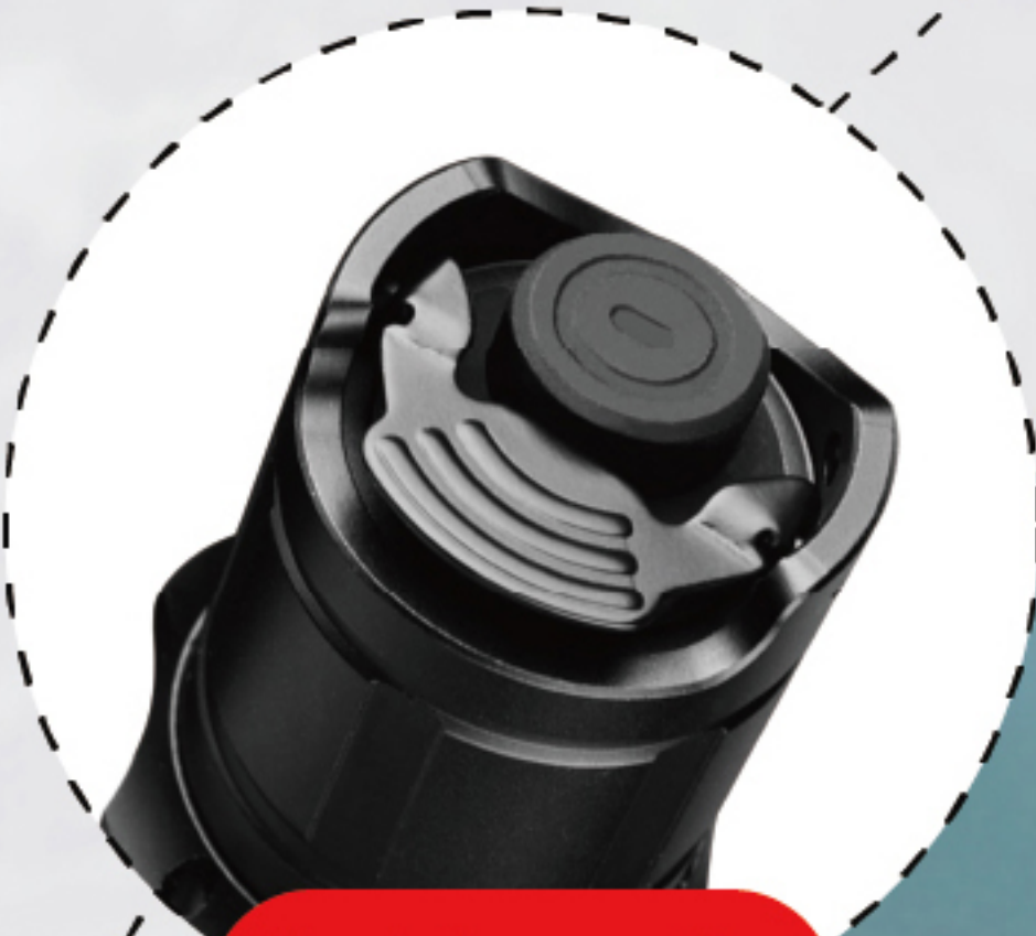
The 4st generation 2016

Intuitive Control One-tap Turbo / Strobe / Low