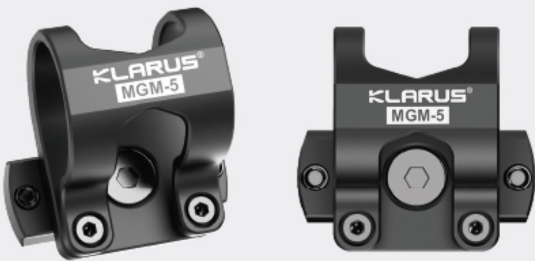
Tactical Helmet Clamp MGM-5