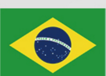
Brazilian Police Station Ordering Model: A1,XT11R