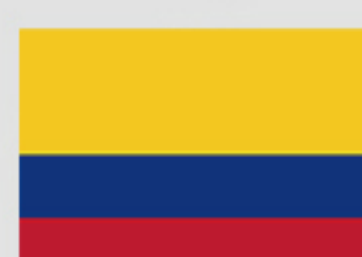
Colombian Police Ordering Model: XT2CR PRO