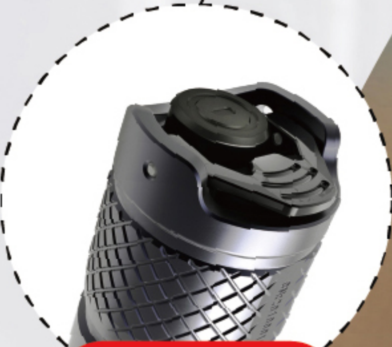
The 3st generation 2014