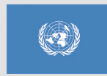
United Nations Peacekeeping Force Ordering Model: XT12S