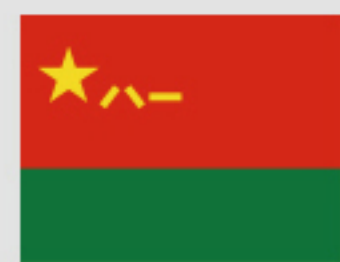
People's Liberation Army Ground Force Ordering Model: XT1C