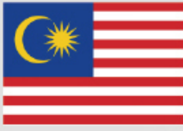
Malaysian Army Ordering Model: RS80GT,XT11S, AR10