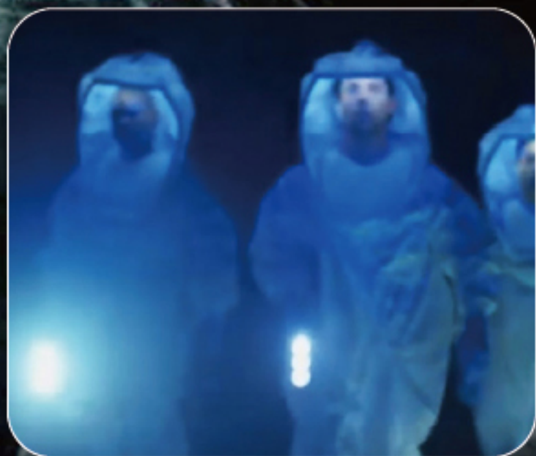
The Walking Dead