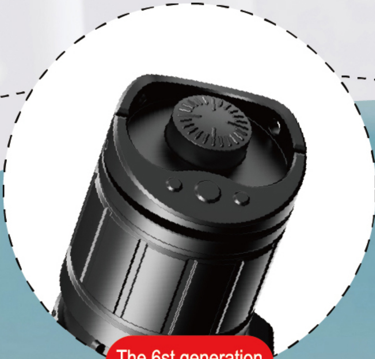
The 6st generation 2015