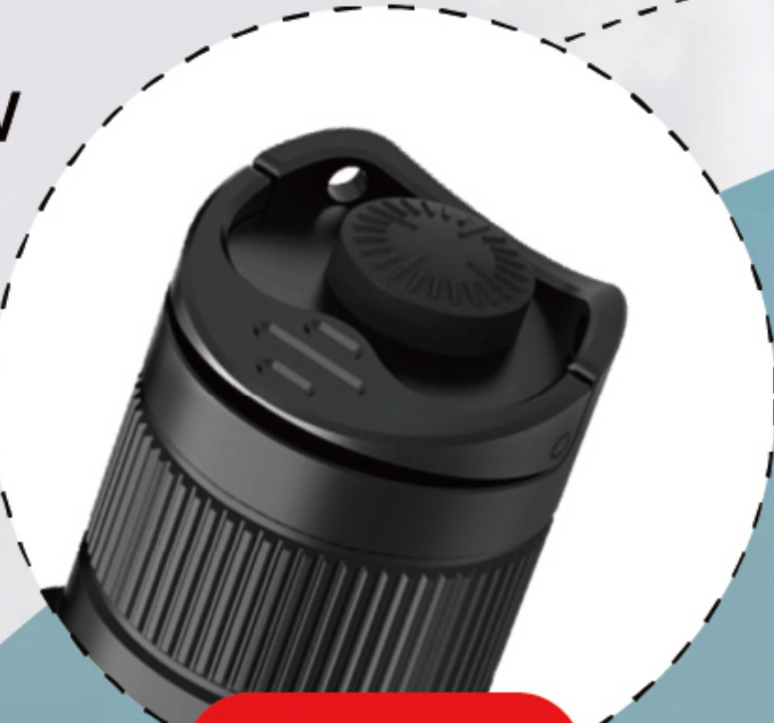
The 5st generation 2021