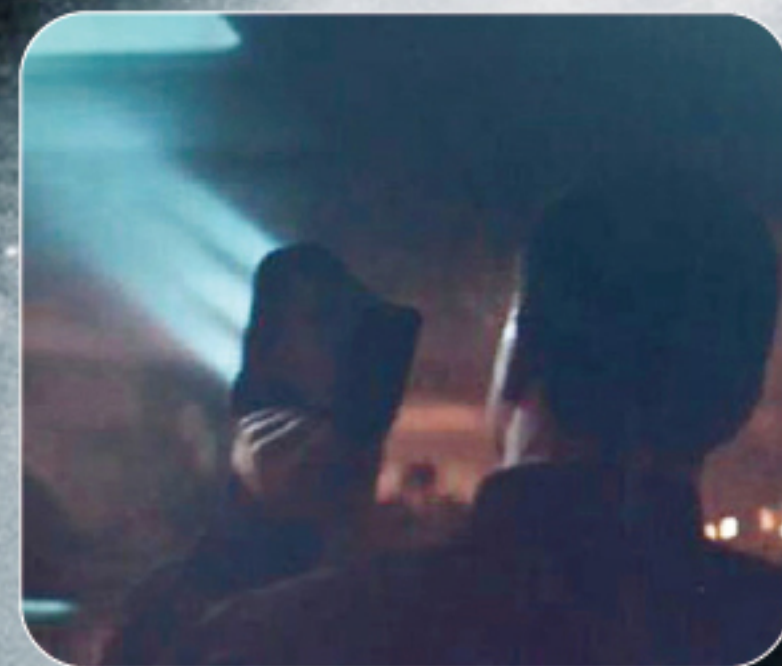
The Hunger Games: Mocking Jay