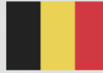
Belgian Federal Police Ordering Model: XT2CR PRO, XT2CR