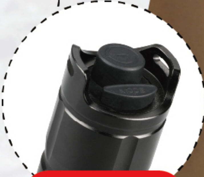
The 2st generation 2012