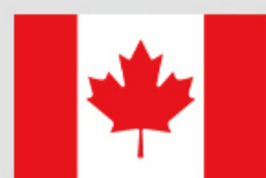
Canadian Federal and Municipal Police Agencies Ordering Model: XT11GT PRO, XT2CR PRO