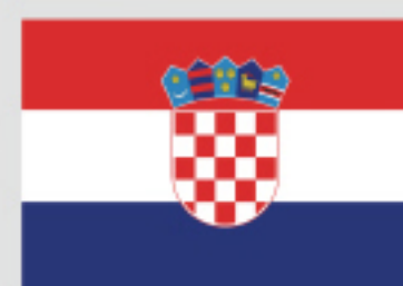
Croatian Police Ordering Model: XT1C