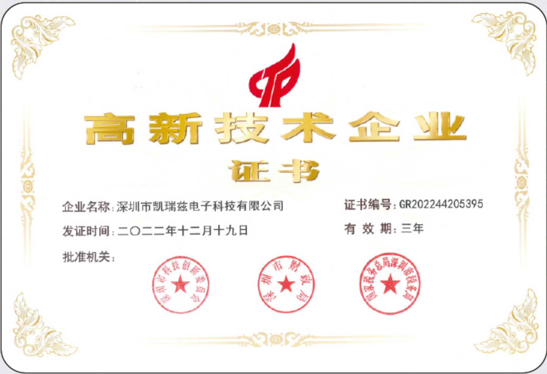
Certificate of National High-tech Enterprise

KLARUS closely monitors the changing conditions of the market and consumers' needs and updates its creations to offer the best combination of technology and design to meet those demands. The ultimate goal of KLARUS is to help the users in meeting every need, no matter when or where, with the most intuitive lighting tools possible.