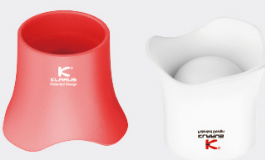
Dreamlike Diffuser KTW-5